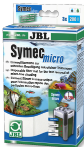
JBL Symec micro Microfibre fleece against water cloudiness