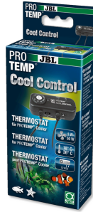
JBL PROTEMP CoolControl Thermostat to regulate cooling fans