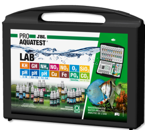
JBL PROAQUATEST LAB Test case with 13 water tests for freshwater analysis