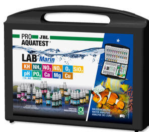
JBL PROAQUATEST LAB Marin Professional test case for marine water analysis