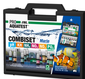
JBL PROAQUATEST COMBISET Marin Test case for water analyses in marine aquariums