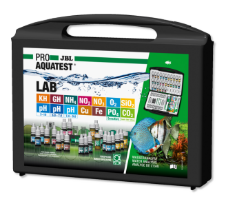
JBL PROAQUATEST LAB Test case with 13 water tests

Test case with most important water tests + iron test