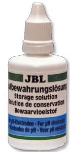
JBL Storage Solution Cleaning and storage solution for pH electrodes