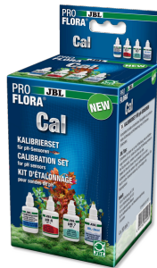
JBL PROFLORA Cal Complete kit for calibration