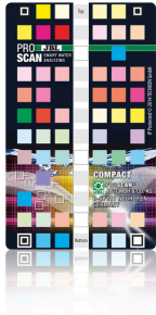
JBL ProScan ColorCard