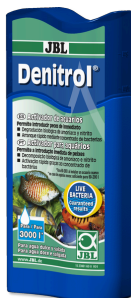
JBL Denitrol Bacteria starter for adding aquarium fish