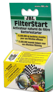
JBL FilterStart Bacteria for the activation of filters