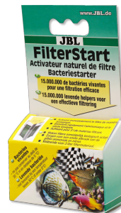
JBL FilterStart Bacteria for the activation of filters