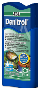
JBL Denitrol Bacteria starter for adding aquarium fish