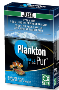
JBL PlanktonPur SMALL Treats for small aquarium fish