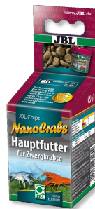
JBL NanoCrabs Main food for dwarf crayfish