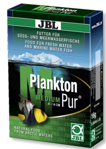
JBL PlanktonPur MEDIUM Treats for large aquarium fish