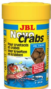
JBL NovoCrabs Main food wafers for crabs