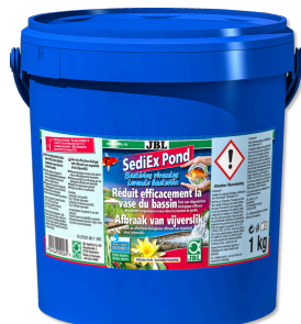
JBL SediEx Pond Bacteria and active oxygen for the breakdown of sludge