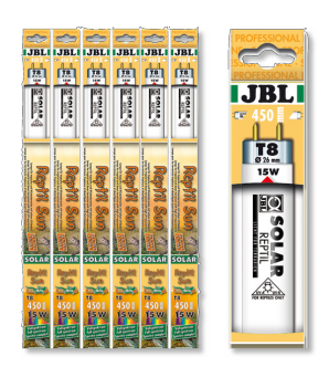
JBL SOLAR REPTIL SUN T8

Special T8 terrarium fluoresc. tube for desert animals