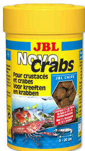
JBL NovoCrabs Main food wafers for crabs