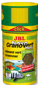
JBL NovoGranoVert mini CLICK

Main food granulate for plant-eating fish