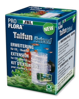
JBL PROFLORA Taifun Extend Extension for CO2 highperformance diffuser