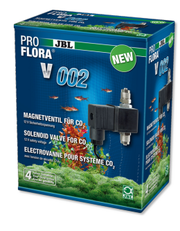
JBL PROFLORA v002 Noiseless solenoid valve