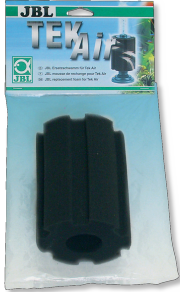
JBL TekAir Filter Sponge Black, fine High-quality sponge for aquarium filter TekAir