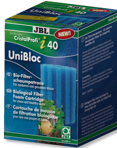
JBL CP i40/TekAir UniBloc blue Foam cartridge for Cristal Profi i40 and TekAir