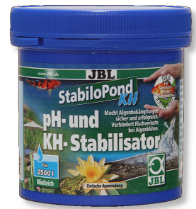
JBL StabiloPond KH pH balancer for garden ponds