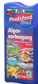
JBL PhosEX Pond Direct Phosphate remover for ponds