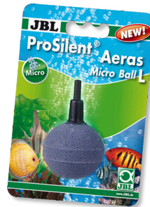
JBL ProSilent Aeras Micro Ball L Air stone for fine air bubbles