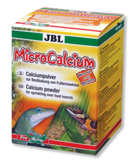
JBL MicroCalcium Mineral supplementary food for all reptiles