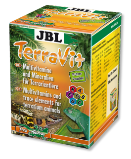
JBL TerraVit Powder Vitamins and trace elements for terrarium animals