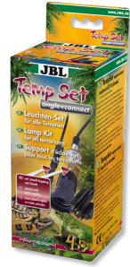
JBL TempSet angle+ connect Installation kit for lamps in terrariums