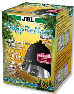
JBL TempReflect light Reflector screen for energy- saving lamps