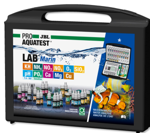
JBL PROAQUATEST LAB Marin Professional test case for marine water analysis