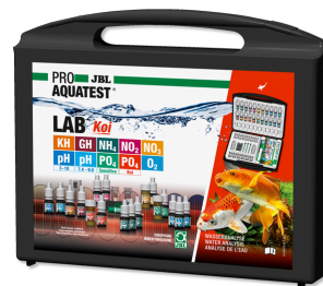
JBL PROAQUATEST LAB Koi Professional test case for koi and garden ponds