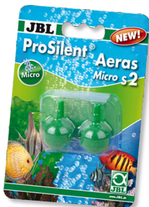
JBL ProSilent Aeras Micro S2 Ball air stones for fine air bubbles in aquariums