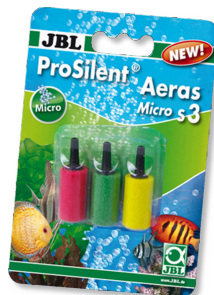
JBL ProSilent Aeras Micro S3 Air stone set for fine air bubbles in aquariums