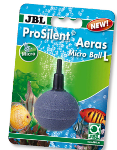
JBL ProSilent Aeras Micro Ball L Air stone for fine air bubbles