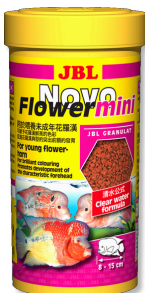
JBL NovoFlower mini Complete food for Flowerhorn Cichlids up to 12 cm