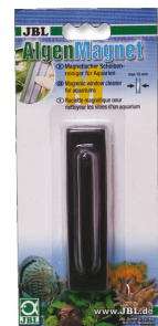
JBL Algae Magnet Magnetic glass cleaner for aquarium panes