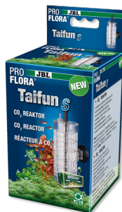
JBL PROFLORA Taifun S Extendable CO 2 diffuser for small aquariums