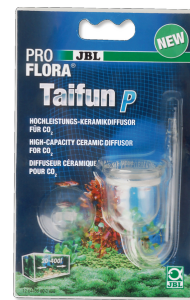
JBL PROFLORA Taifun P Mini CO 2 diffuser for nano freshwater aquariums