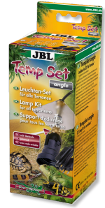
JBL TempSet angle Installation kit for lamps in terrariums