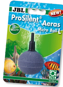
JBL ProSilent Aeras Micro Ball L Air stone for fine air bubbles