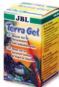
JBL TerraGel Water gel for terrarium animals