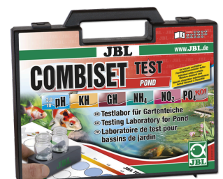
JBL Test Combi Set Pond The most important water tests for garden ponds