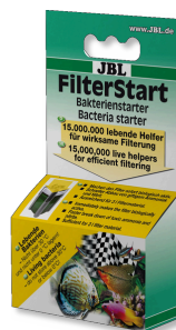
JBL FilterStart Bacteria for the activation of filters