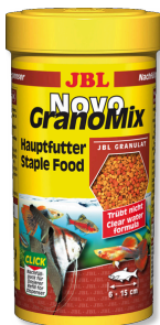
JBL NovoGranoMix Main food for medium-sized and large aquarium fish