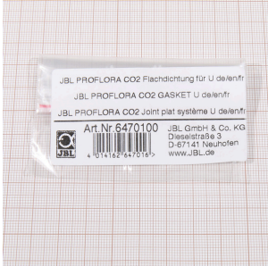
JBL PF CO2 flat gasket for u