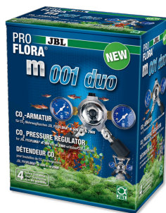
JBL PROFLORA m001 duo Fitting to reduce pressure for 2 CO2 diffusers