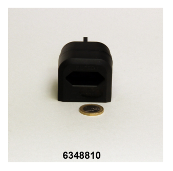
JBL adapter UK for all flat-pin plugs