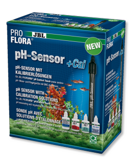
JBL PROFLORA pH-Sensor+Cal