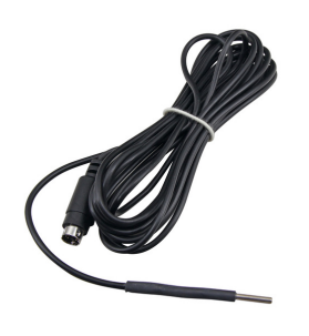
JBL pH Control temperature sensor