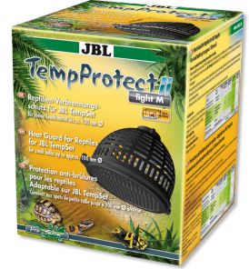
JBL TempProtect II light Reptile thermal burn protection for JBL TempSet items