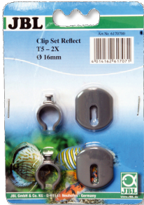
JBL SOLAR REFLECT Clip Set Holder for fluorescent tubes