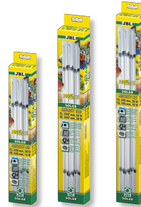
JBL SOLAR Reflect T5/ T8 - 895-1500 mm Reflector panel for fluorescent tube