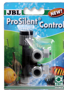
JBL ProSilent Control Adjustable precision air shut-off valve