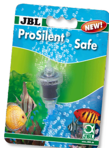
JBL ProSilent Safe Water backflow stop