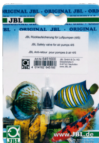
JBL backflow protection Backflow stop for air pumps