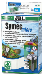
JBL Symec micro Microfibre fleece against water cloudiness