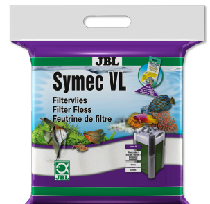
JBL Symec VL Filter wool fleece to remove water cloudiness