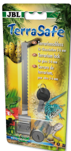
JBL TerraSafe Lock for terrarium pane