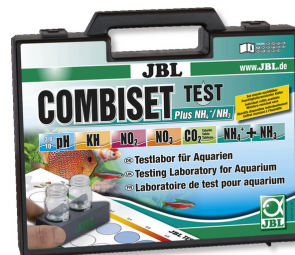
JBL Test Combi Set Plus NH4 Test case with most important water tests + NH4 test