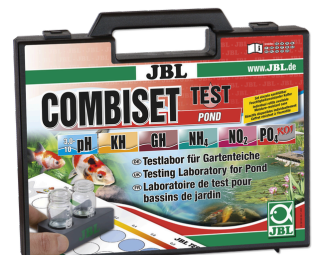
JBL Test Combi Set Pond The most important water tests for garden ponds