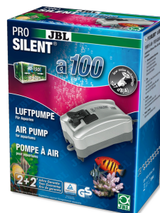
JBL PROSILENT a100 Air pump for fresh and saltwater aquariums