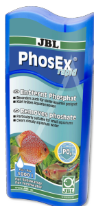
JBL PhosEx rapid Phosphate remover for freshwater aquariums