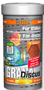
JBL GranaDiscus Premium main food granulate for discus fish