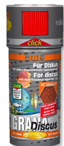
JBL GranaDiscus CLICK Premium main food granulate with doser for discus fish