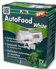
JBL AutoFood WHITE White automatic feeder for aquarium fish