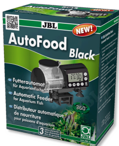
JBL AutoFood BLACK Black automatic feeder for aquarium fish