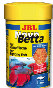
JBL NovoBetta Complete food for labyrinth fish, e.g. fighting fish