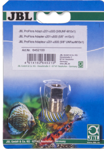
JBL PROFLORA Adapt u201-u500 Adapter for pressure reducer u201