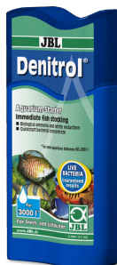
JBL Denitrol Bacteria starter for adding aquarium fish