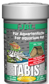
JBL Tabis Premium food tablets for freshwater and marine fish