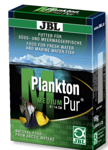
JBL Plankton Pur MEDIUM Treats for large aquarium fish