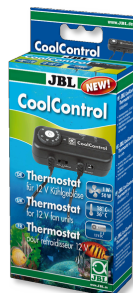
JBL CoolControl Thermostat to regulate cooling fan