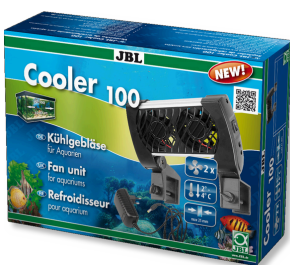
JBL Cooler 100 Cooling fan for fresh- and saltwater aquariums