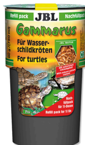
JBL Gammarus Refill pack Treats for turtles from 10 to 50 cm